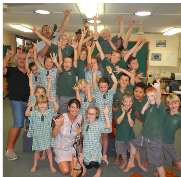
The team practising hard for Rockfest

The students need to be in their Rockfest shirts at Ned's Beach by 3pm for the performance this afternoon.