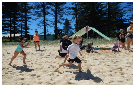
Fast as lightning!!