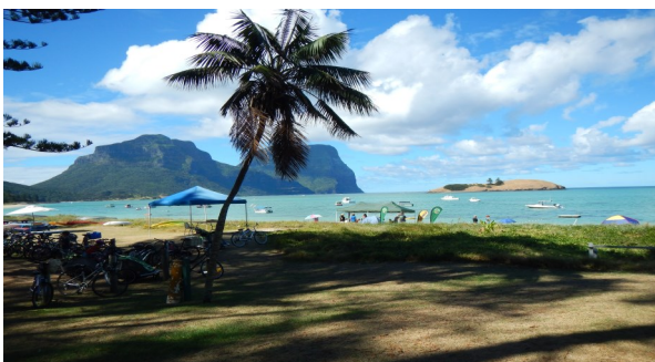
A perfect place for a swimming carnival