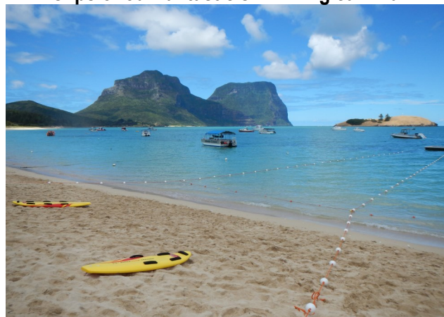
A perfect day