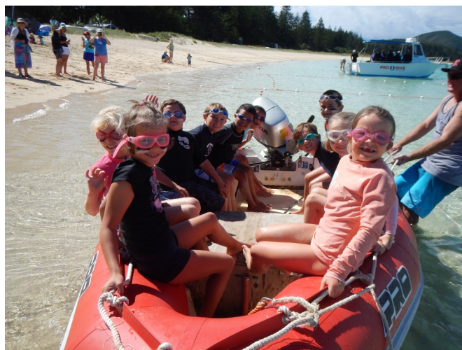
Out to the raft we go!!!