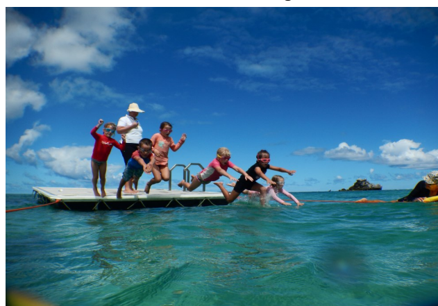
Oops my belly hurts!!